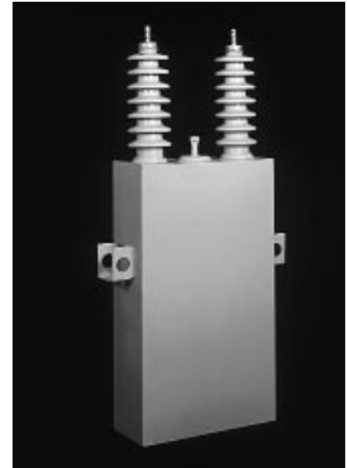
Figure 1. The McGraw Edison EX-7Li® single phase internally fused, all-film capacitor

Single-phase capacitor units are designed to produce rated kvar at rated voltage and frequency within the tolerance of the applicable standard. As the capacitor's kvar output is proportional to the square of the applied voltage, proper application requires attention to the applied voltage.